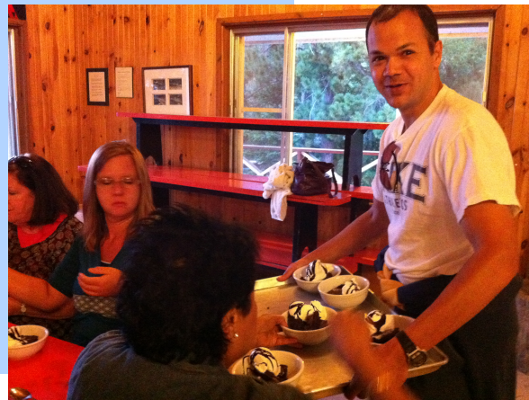
Walk for Mental Health